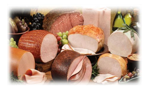
Exhibit 22: Cold/Slicing Products of Rich