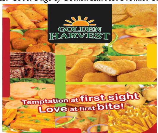
Exhibit 23: Cover Page of Golden Harvest Product Catalogue

Golden Harvest began its journey as a commodities brokerage house, and over the years they have expanded into wide sectors including Information Technology, Consumer Foods, Food Grains, Edible Oils, Distribution, Aquaculture, Logistics, Shipping and Banking & Finance. With clear objectives—'to help satisfy growing demands they are always expanding our operations to help position us for growth and success' today they stand as a leading player in a growing industry. Golden Harvest is fully committed to its social responsibility and they operate a Charitable Hospital and a Trust for providing assistance to the disadvantaged. In their food business they have three branches—Agro Industries Ltd, Sea Food & Fish Processing Ltd., and Organic Aquaculture Holdings Limited.