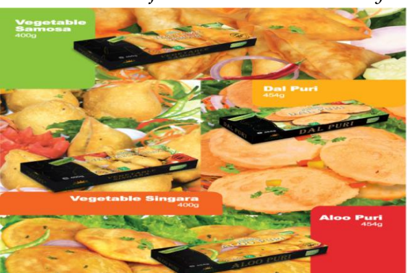
Exhibit 24: Illustration of Few Golden Harvest Ready to Cooks