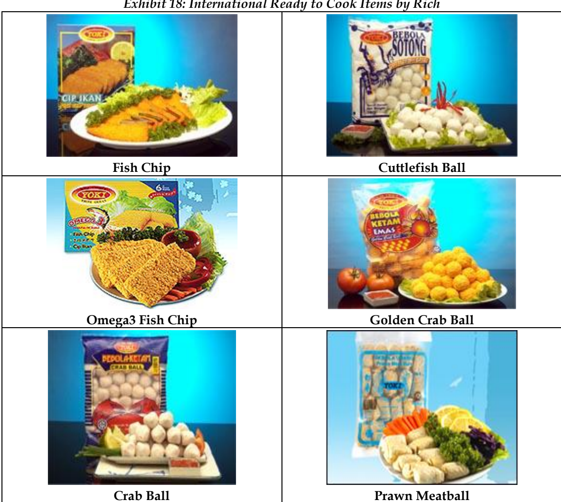
Exhibit 18: International Ready to Cook Items by Rich

Supplier Chain Management: Harvest Rich Agro Industries Ltd. sources supplies of its requirements of raw materials locally through contract farmers. Locally, the company has an ongoing commitment to regularly monitor local contract farmers & suppliers operations, visiting their farms and offering technical know-how and financial support to improve their quality and standards. This is their success story of their quality consistency by strengthening a loyal and quality chain of suppliers.