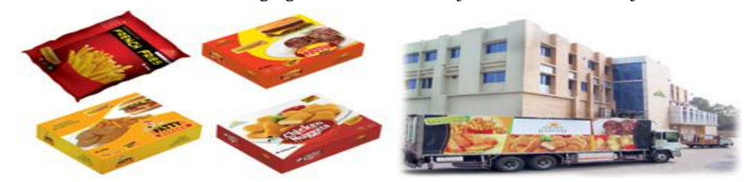
Exhibit 26: Golden Harvest Packaging is World Class, they have Smart Delivery Network

Other than ready to cook product line, they also have frozen vegetables, frozen sea foods and shrimps which are getting huge export growth every year.