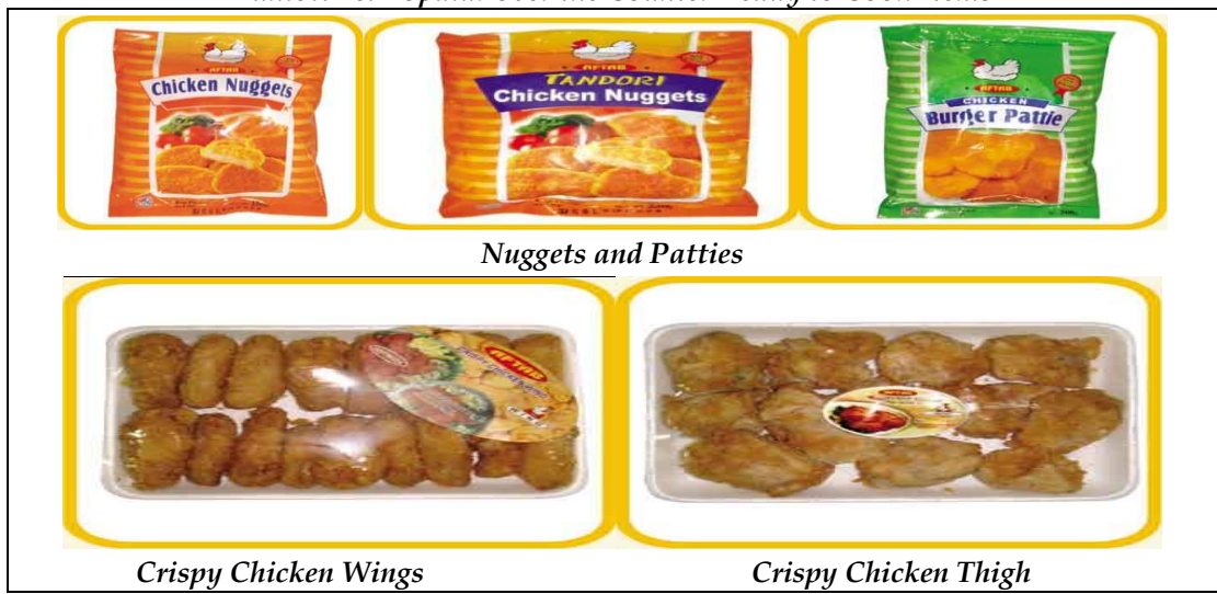
Exhibit 16: Popular over the Counter Ready to Cook Items

Broast/Nugget/Kebab: Recently packed chicken broast, wings, nugget, beef or mutton kebab are available in various general grocery shops in Bangladesh. Local and foreign manufacturers supply them. Aftab and Rich are to two popular brands for chicken nuggets, burger pattie, chicken wings, and thigh. Chicken Shammi Kebab, Fried and breaded chicken drumsticks is one of the best packed food items in Bangladesh.