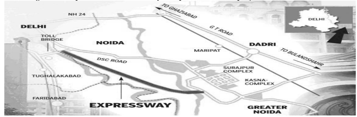
Fig.3 Yamuna Express Location

Sighting strong potential of this area, a large number of leading developers are either already active here, or planning to launch their projects along the expressway. Property market here has looked up ever since the expressway got opened for commuting. The real estate companies are witnessing about 50 per cent increase in buyers' queries for their projects now.