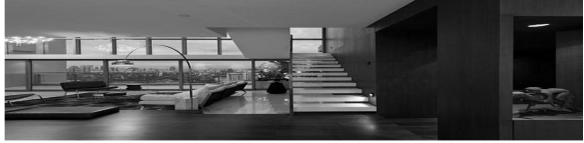
Fig.2: High Class Commercial Complex Interior Developed in Noida

Greater Noida and its proximity to Delhi-Mumbai Industrial Corridor have further fuelled the growth of real estate along this area.