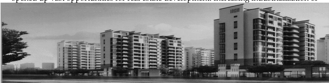
Fig.1: High Class Residential Flats Developed in Noida

opened up vast opportunities for real estate development. Increasing industrialization of