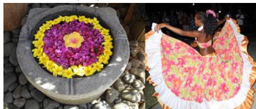
Figure 7. Rondel Artifact Replicated in Mauritian Fashion

Rosettes or rondels were apparent in door frames, chair backs, table legs, bed frames and other furniture designs of East Indies influence. This same rosette concept was apparent in circular embellishments or part of the overall textile design. Figure 7 illustrates a decorative rosette furnishing found in a tourist attraction (left) and Mauritian fashion with similar motif.