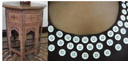
Figure 6. Embellished Table Replicated in Mauritian Fashion

East Indies furniture had swirled carvings of leaves, flowers, or geometric lines often inlaid with pearl or painting. These highly ornamental and decorative embellishments were often repeated design elements in women's fashions. Mauritian garments, whether they were evening or day wear, were heavily embellished creating the inlay effect in fabric. Figure 6 illustrates a decorative embellishment furnishing found in a tourist attraction (left) and Mauritian fashion with similar motif.