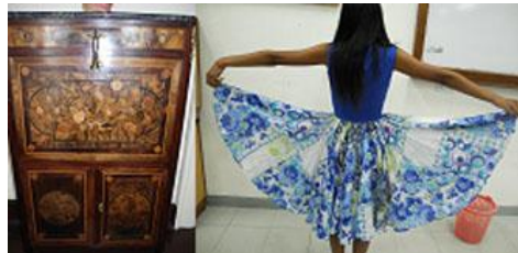
Figure 2. Marquetry Chest Replicated in Mauritian Fashion

Colonial India Style furniture reflects Hindu architecture and design and is known for details such as inlaid ivory, gilt mirrors, ornate scrolled legs found in tables, chests, and dressers. Inlaid woods and marquetry are prevalent. Intricate designs in cloth, draperies, rugs, pillows, throws are prevalent. Exotic, practical, cheerful, bright, animal prints, Indian sari fabrics, and detailed prints that portrayed the British adopted lands are evident in colonial décor and colors. Figure 2 illustrates marquetry in furniture found in a tourist attraction (left) and Mauritian fashion with similar motif.