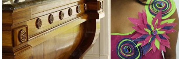
Figure 5. Rondels on a Chest Replicated in Mauritian Fashion

The most predominant correlation between past furniture and present fashion was identifiable artistic design. Three design elements were evident: Marquetry/inlay, Rondels and Embellishments. Figure 5 illustrates rondels in a furnishing found in a tourist attraction (left) and Mauritian fashion with similar motif.