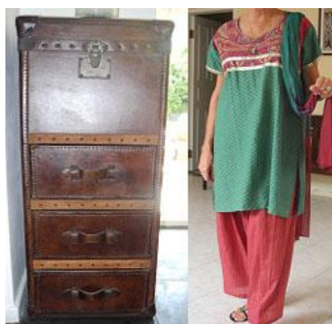
Figure 3. Campaign Suitcase Chest Replicated in Mauritian Fashion

Furniture hand carved by Chinese artisans in rosewood represents the Asian/Chinese influence found in Mauritius. Figure 4 illustrates a carved furnishing found in a tourist attraction (left) and Mauritian fashion with similar motif.